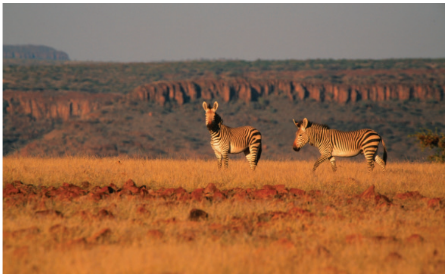
Grazing the high plateaus of Damaraland, two Hartmann's mountain zebras soak in the last of the sunset.