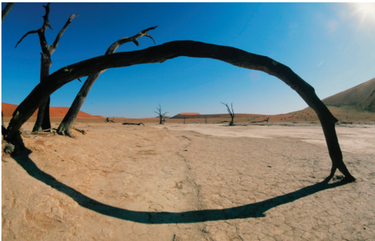
Dead Vlei has a ghostly presence to it with its dead camel thorn trees.