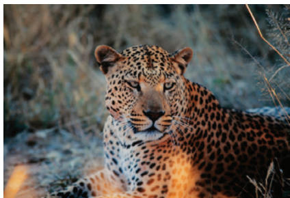
Leopards blend in well in the Southern African desert.

The Etendeka Plateau in the foothills of the Grootberg massif is set among ancient lava flows of northern Damaraland. The craggy basalt has been slowly eroded over millennia, leaving scattered boulders lying upon dramatic flat-topped mountains. Atop those mountains are sweeping grasslands where the rare Hartmann's mountain zebra still thrives. There are