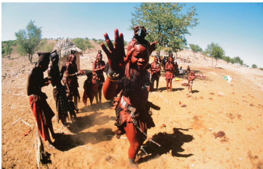
Himba women performing a traditional dance.